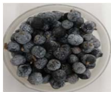
Fig. 1 Ripe J. excelsa galbuli from (authors' image)